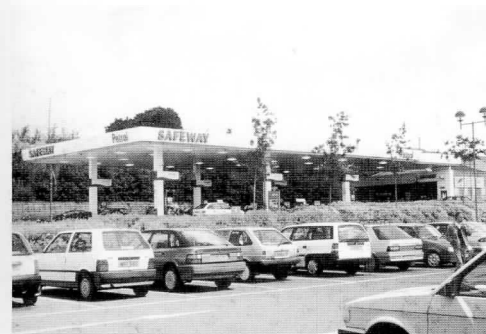
The white part of the fascia blends well into the skyline, but would it be too obtrusive when viewed against a darker background? Note the landscape setting.