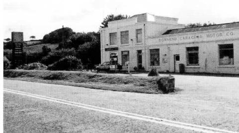
Are canopies always necessary? Note the grass background along the front boundary, which helps to mask the forecourt paving.