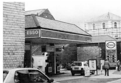
Pylon signs do not have to be tall to display the necessary information. Height is an important issue in historic towns and villages. The brightly coloured shiny fascia is visually intrusive.